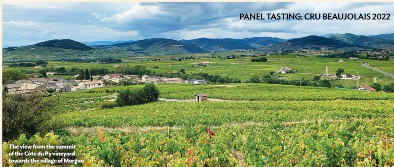
The view from the summit of the Côte du Py vineyard towards the village of Morgon