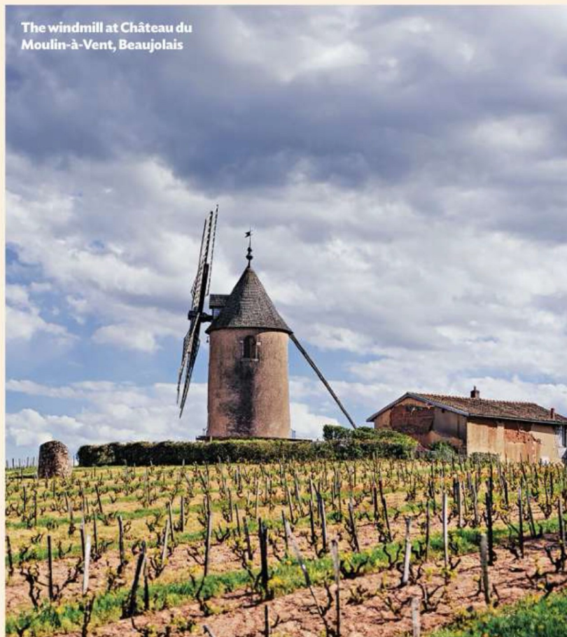
The windmill at Château du Moulin-à-Vent, Beaujolais